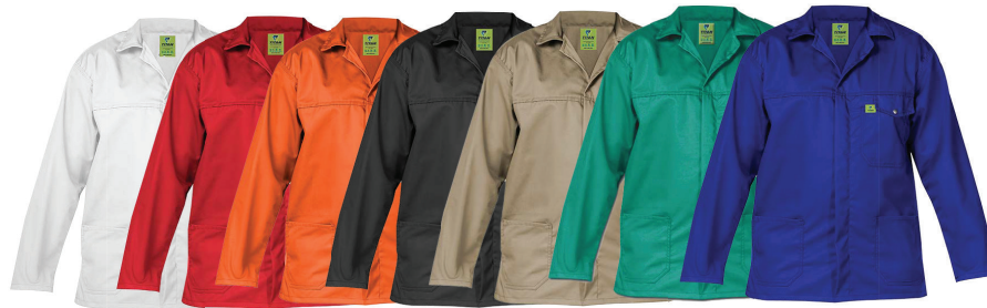
White Red Orange Charcoal Khaki Emerald Green Royal Blue