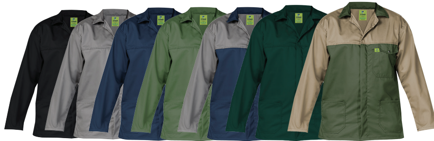
Black Grey Navy Fatigue Navy/Grey Bottle Green Fatigue/Khaki